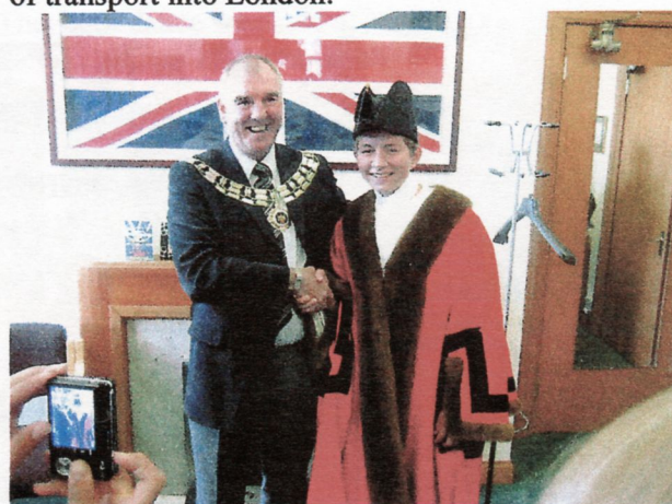
Our Mayor meets his German double

advantage of the slightly cheaper self catering option, and made use of the facilities and the ease of transport into London.