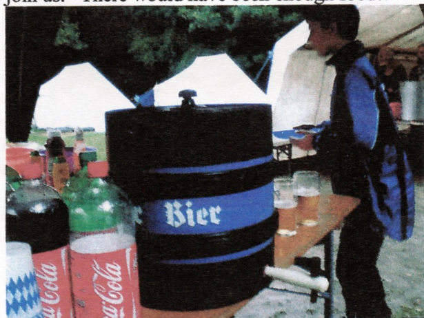
Spalt beer was the highlight of the BBQ

A torrential downpour did not dampen anyone's spirits and the whole meal, was served up cheerfully with expert attention to detail – including the mustard. A full barrel of local beer had been transported all the way from Spalt and added the final touches. It was only a pity that the local scout groups who had also been invited were not able to join us. There would have been enough food!!