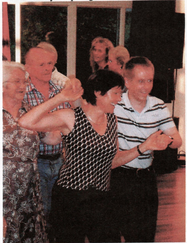
The barn dance was, as usual, great fun

The barn dance was held at Nightingale Hall, in the old Warley Hospital grounds.