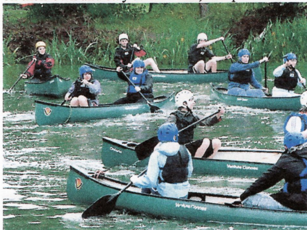
Enjoying the facilities at Stubbers

The first of these was in May, 2008, and was a group of final year students from the Hauptschule in Hilpoltstein. This is a school which would dearly love to exchange but for whom no partner school has yet been found, so they decided to come on their own and stay at Stubbers, in Upminster.