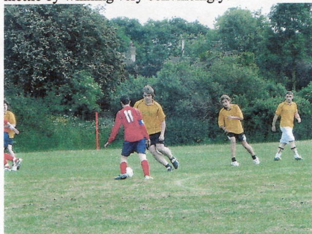
The German boys (in yellow) were definitely bigger!